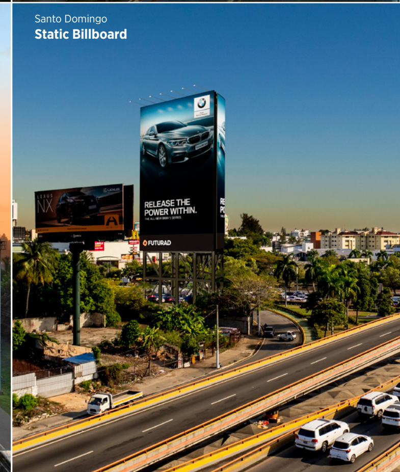
Santo Domingo Static Billboard