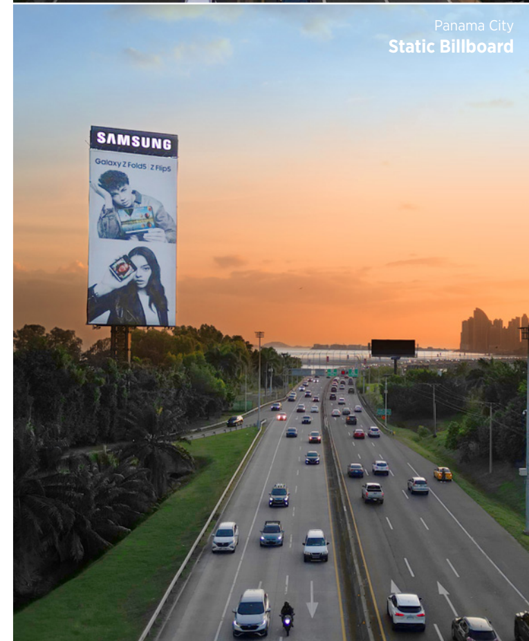
Panama City Static Billboard