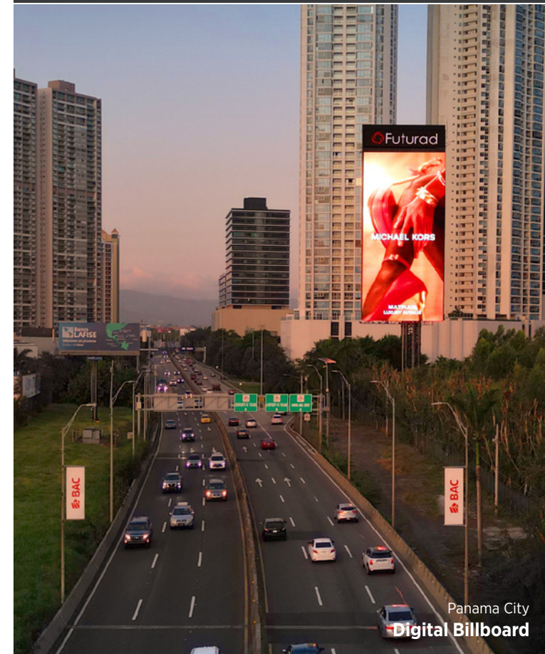
Panama City Digital Billboard

Outdoor static billboard advertising relies on strategic location, compelling design, large scale, brand consistency, cost-effectiveness, longevity, local relevance, minimal distractions, non-intrusiveness, and consistent messaging to effectively reach and engage audiences, boosting brand awareness and influencing consumer behavior.