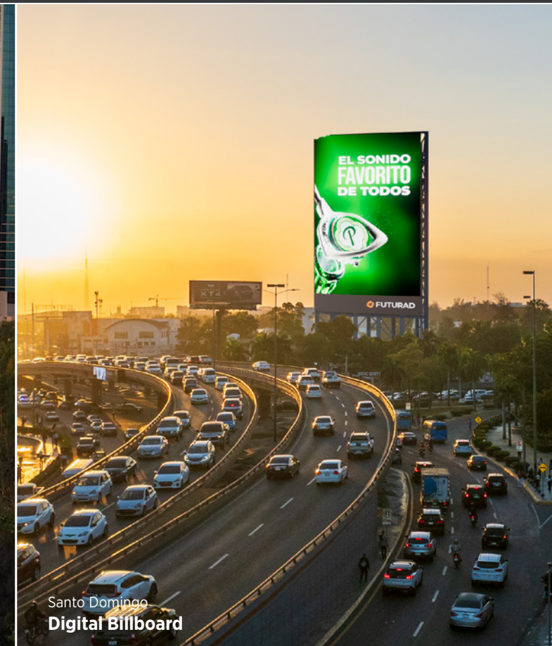
Santo Domingo Digital Billboard